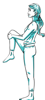
⑤ Standing Knee to Chest