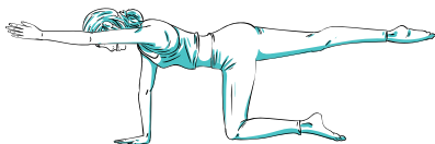
⑦ Bird Dog