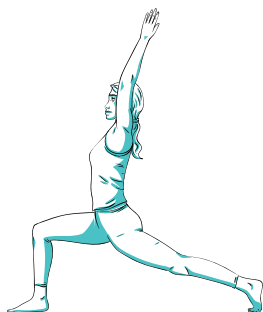
④ High Lunge