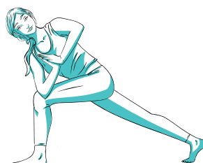
⑪ Revolved High Lunge