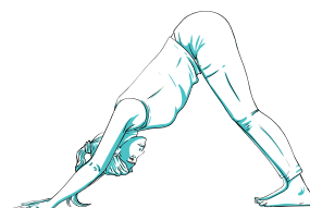
⑧ Down Dog